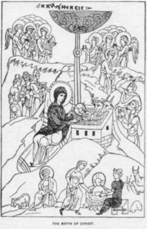
IN A "BOOK OF THE PRANCELING." GAME MANINGHAT OF THE TWELFTH CENTURE

This is an illustration entitled "The Birth of Christ" from a 12th century greek manuscript "The Book of the Evangelists". If you look to the right of the picture there two figures looking up at a semi-circular object with figures inside. The object appears to be shining a beam of light down onto the birth. One of the pair of observers is shielding his eyes, possibly the artist was trying to convey the brightness of the object.